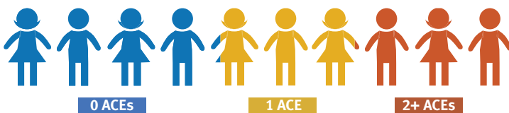
Children 0-17 years of age in Arizona

When it comes to legislation, Arizona-specific ACEs data will provide a powerful new tool for